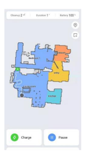
Mobile App Control