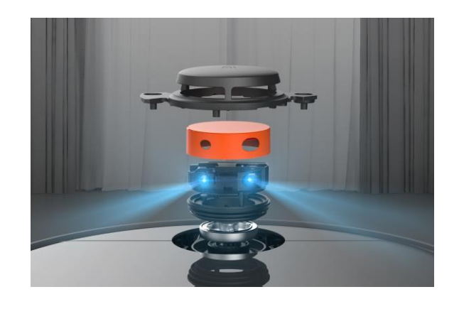
Updated LDS Navigation System