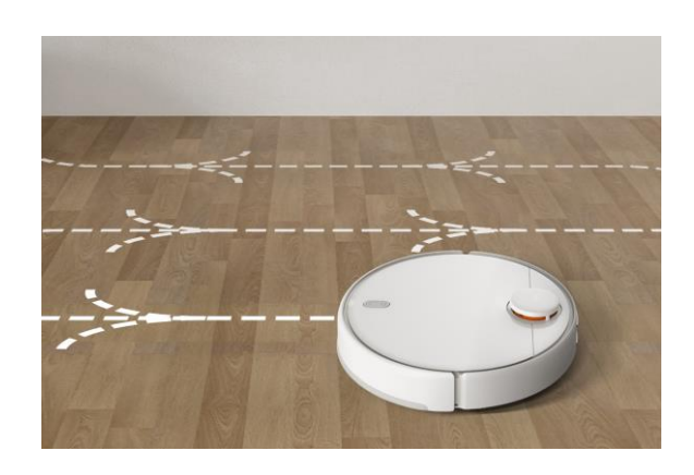
Mop:simulate artificial mopping,scrub