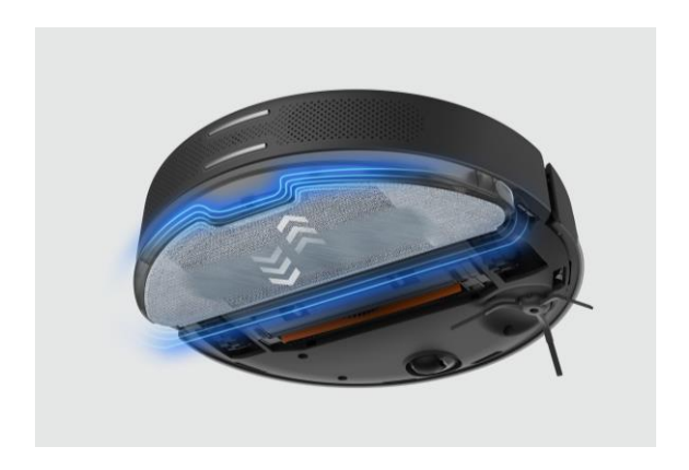
High-frequency sonic vibration mopping