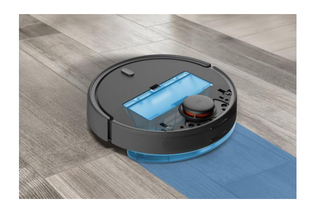
Removable High-capacity Dust Compartment & Water Tank