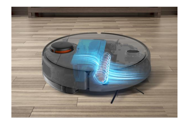
3000Pa Powerful Suction