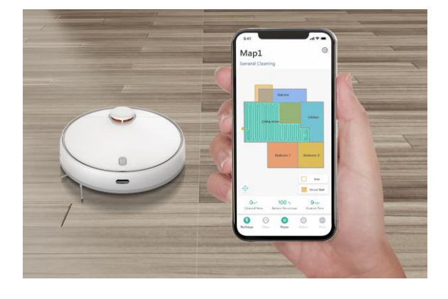
Mi Home/Xiaomi Home App Control