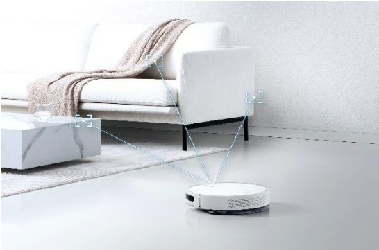
Visual dynamic navigation system Quick capture room structure info and setup map