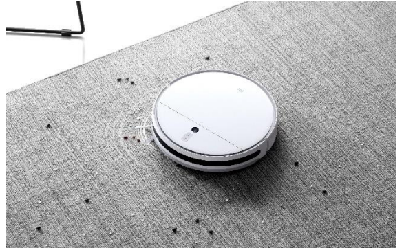
2700Pa huge suction power with 550ml dust bag