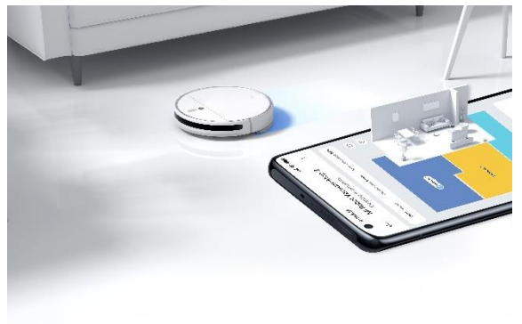
Mobile App control