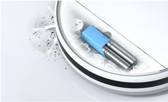
3200mAh large Capacity Lithium Battery