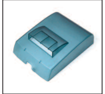
Splash Proof Cover