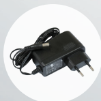
24V 0.38A Adapter