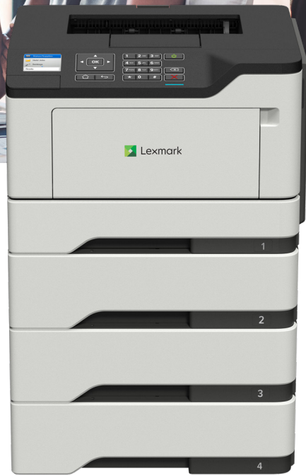
B2546dw with optional trays