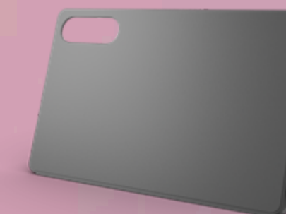
Lenovo Folio Case for Yoga Tab ZG38C07678