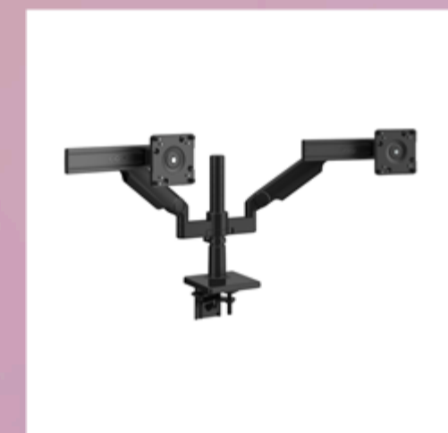
Humanscale Dual Monitor Arm Black 4ZE1U10766