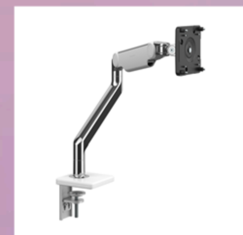
Humanscale Single Monitor Arm White 4ZE1U10765

Please click here to view the full list of accessories.