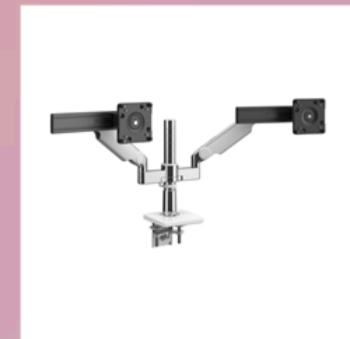
Humanscale Dual Monitor Arm White 4ZE1U10767