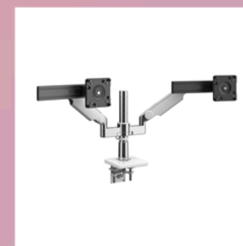
Humanscale Dual Monitor Arm White 4ZE1U10767