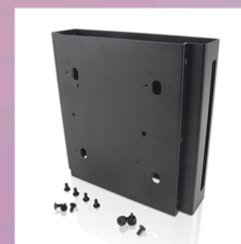
ThinkCentre Tiny Sandwich Kit II 4XH0N04098

Please click here to view the full list of accessories.