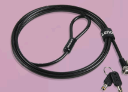
Kensington MicroSaver DS 2.0 Cable Lock from Lenovo 4XE1L68273