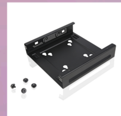
ThinkCentre Tiny VESA Mount II 4XFON03161

Please click here to view the full list of accessories.