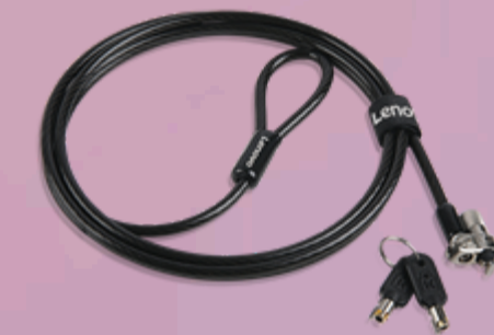
Kensington MicroSaver DS 2.0 Cable Lock from Lenovo 4XE1L68273