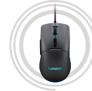
Lenovo M210 RGB Gaming Mouse