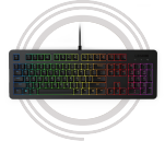
Legion K310 RGB Gaming keyboard