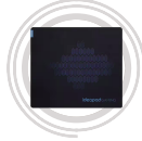
Lenovo Cloth Gaming Mousepad L