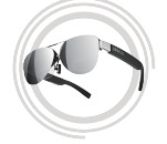
Legion Glasses Gen2