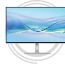
Lenovo Legion 27-10 Monitor