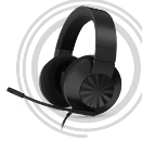
Lenovo H210 Gaming Headset