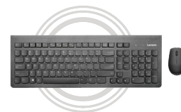
Lenovo 500 Wireless Combo Keyboard & Mouse