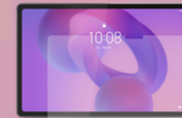
Lenovo Idea Tab Plus Glass Screen Protector ZG38C07403