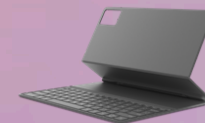
Lenovo Folio Keyboard For Idea Tab Plus ZG38C07498

Please click here to view the full list of accessories.