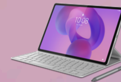
Lenovo Folio Keyboard For Idea Tab Plus ZG38C07499