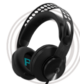
Lenovo Legion H300 Gaming Headset

* Example of Lenovo Legion catalogue naming convention