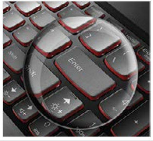
BACKLIT KEYBOARD Backlit keyboard, now with Windows 8 function keys, for a better user experience