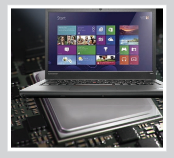
Packing an Intel® Core™ i processor into a 1.58kg package delivers top performance in a portable device