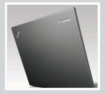
Carbon fiber strengthens and protects the system without weighing