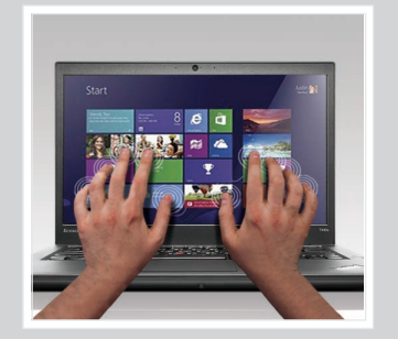
TOUCH AND GO Full HD display with 10-finger multitouch