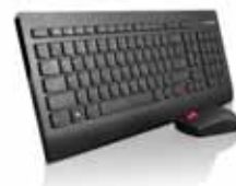
Lenovo Ultrastim Plus Wireless Keyboard and Mouse (0A34032)