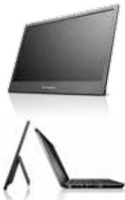
ThinkVision LT1421 Wide Mobile Monitor (1452-DS6)

Easily transport and protect your ThinkPad www.lenovo.com/support/cases