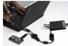
Lenovo 90W Ultrastim AC/DC Combo Adapter (41R4493)