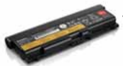
ThinkPad Battery 70++ 9-cell (0A36303)