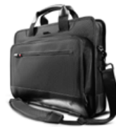
ThinkPad Business Topload Case (43R2476)

Easily transport and protect your ThinkPad www.lenovo.com/support/cases