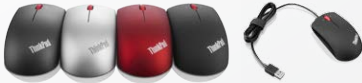
ThinkPad® Precision Wireless/USB Mouse (0B47163, 0B47153)