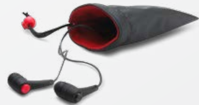
ThinkPad® In-ear Headphones (57Y4488)