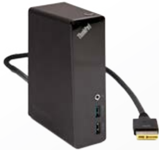
ThinkPad® OneLink black Dock (4X10A060xx) 4