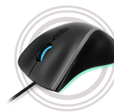
Lenovo Legion M500 RGB Gaming Mouse