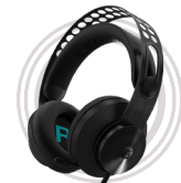
Lenovo Legion H300 Gaming Headset

* Example of Lenovo Legion catalogue naming convention