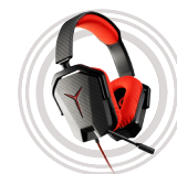
Lenovo Y Gaming Stereo Headset