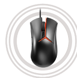
Lenovo Y Gaming Optical Mouse