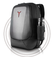
Lenovo Y Gaming Armored Backpack

* Example of Lenovo Legion catalogue naming convention