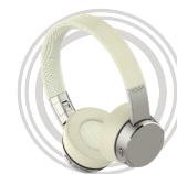
Lenovo Yoga Active Noise-cancellation Headphones