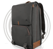
Lenovo 15.6" Laptop Urban Backpack B810