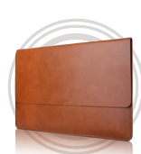
Lenovo 13" Laptop Leather Sleeve