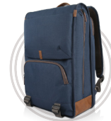
Lenovo 15.6" Laptop Urban Backpack