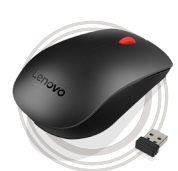
Lenovo 510 Wireless Mouse