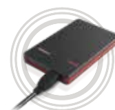
F310S USB 3.0 External Backup Hard Drive