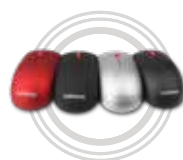
Lenovo 500 Wireless Compact Precision Mouse