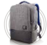
NAVA 15.6" On-trend Backpack