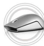
Lenovo 500 Wireless Mouse