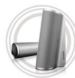
Lenovo 500 2.0 Bluetooth® Speaker