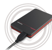
F310S USB 3.0 External Backup Hard Drive