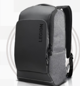
Lenovo Legion 15.6" Recon Gaming Backpack

* Example of Lenovo catalogue naming convention