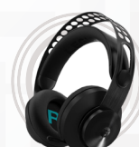
Legion H300 Stereo Gaming Headset