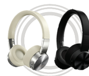
Lenovo Yoga Active Noise Cancellation Headphones