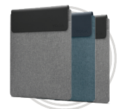
Lenovo Yoga Sleeve