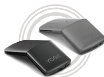
Lenovo Yoga Mouse with Laser Presenter