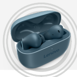
Lenovo TWS YOGA PC Edition