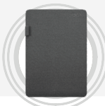
Lenovo YOGA 14-inch Sleeve