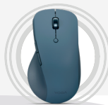
Lenovo Yoga Pro Mouse