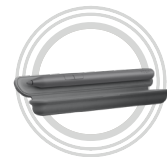
Lenovo Yoga Pen Gen 2 with Case