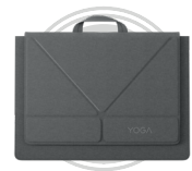
Lenovo Yoga Tote Sleeve