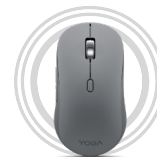
Lenovo Yoga Bluetooth Silent Mouse