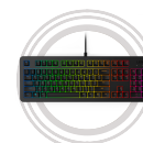
Legion K310 RGB Gaming keyboard