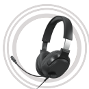
Lenovo Ideapad Gaming H100 Headset