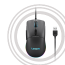
Lenovo M210 RGB Gaming Mouse