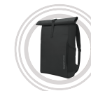
Lenovo IdeaPad Gaming Modern Backpack