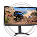
Legion Y27h-30 Monitor