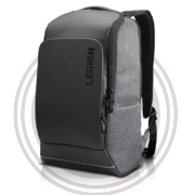
Lenovo Legion 15.6" Recon Gaming Backpack

* Example of Lenovo Legion catalogue naming convention