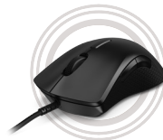
Lenovo Legion M300 RGB Gaming Mouse