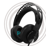
Legion H300 Stereo Gaming Headset