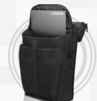
Lenovo Legion Active Gaming Backpack