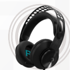
Lenovo Legion H300 Stereo Gaming Headset