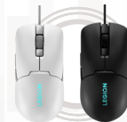
Lenovo Legion M300s RGB Gaming Mouse