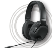
Lenovo IdeaPad Gaming H100 Headset