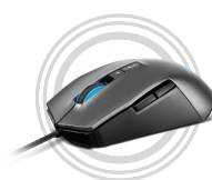
Lenovo IdeaPad Gaming M100 RGB Mouse