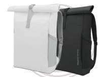
Lenovo IdeaPad Gaming Modern Backpack

* Example of Lenovo catalogue naming convention