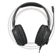
Lenovo IdeaPad Gaming H100 Headset