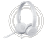
Lenovo 110 USB Stereo Headset