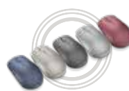
Lenovo 530 Wireless Mouse