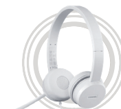
Lenovo 110 USB Stereo Headset