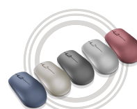
Lenovo 530 Wireless Mouse