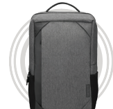
Lenovo 15.6" Laptop Urban Backpack B530