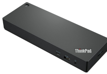
ThinkPad Workstation Thunderbolt™ 4 Dock