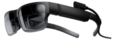
ThinkReality A3 XR1 3G+32G