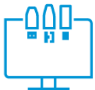
Monitor connectivity options

Rest assured that your IT investment is supported with our three-year standard limited warranty. To extend your protection, select an optional HP Care service.