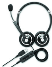
HP UC Wired Headset

Enable crystal-clear sound and noise cancelling for meeting on-the-fly through your Windows notebook or tablet with the durable and lightweight HP UC Wired Headset, designed for a comfortable work day. 1,2 Product number: K7V17AA