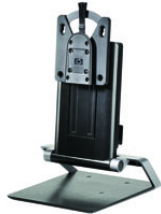
HP Integrated Work Center for Desktop Mini and Thin Client

Make the most of small work spaces with an HP IWC Desktop Mini/Thin Client that lets you create a compact desktop solution by combining a display 1 with your choice of platform 1 and giving you convenient front access to all of its inputs. Product number: G1V61AA