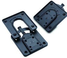
HP Quick Release Bracket 2

Use the HP Quick Release Bracket 2 to attach your HP Desktop Mini to an HP display 1 and a variety of stands, arms or wall mounts. 2 The failsafe "Sure-Lock" mechanism snaps the PC securely in place, and can be further secured with a theft-deterrent security screw. Product number: 6KD15AA