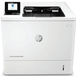
HP LaserJet Enterprise M607n

This HP LaserJet Printer with JetIntelligence combines exceptional performance and energy efficiency with professional-quality documents right when you need them – all while protecting your network from attacks with the HP's deepest security 1