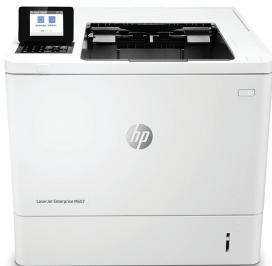
HP LaserJet Enterprise M607dn