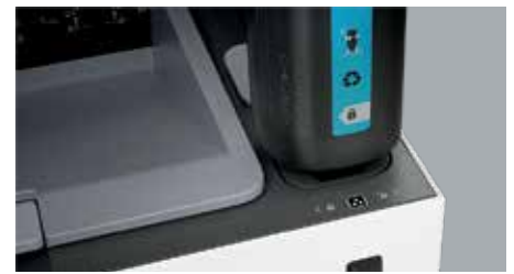
Uses the HP Black Original Neverstop Laser Toner Reload Kit 4