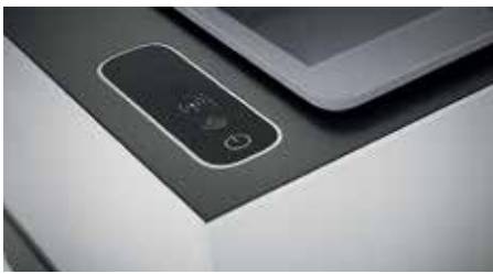
Intuitive user interface