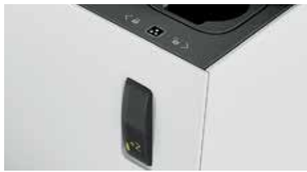
Real-time status on toner level