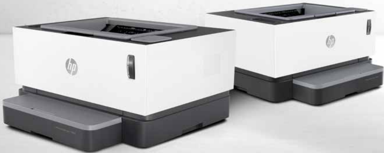
HP Neverstop Laser 1000w

Easily print at high volumes with the HP's first self-reloadable 4 laser printer in class – includes 5,000 pages of toner right out of box before reload. 9 Count on HP quality at an ultra-low cost. Print virtually from anywhere with HP Smart. 2,3,8