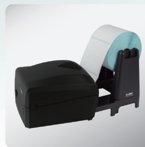
High cost-effectiveness for large amount printing