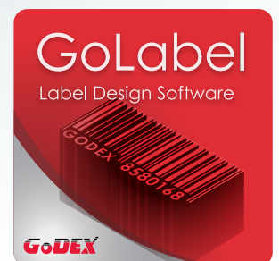
Free labeling software GoLabel for easy printing