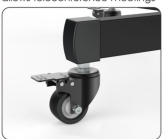
Sturdy Base with Heavy-duty Casters supports easy maneuverability and ensures reliable performance for years of use.