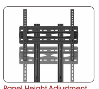
Panel Height Adjustment promotes a customized placement to match different viewing needs anytime.