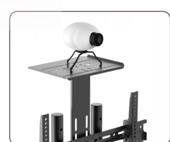
Height Adjustable Camera Shelf allows teleconference meetings