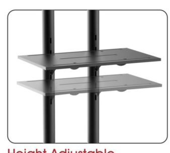
Height Adjustable Component Shelf offers more space to hold AV equipment.