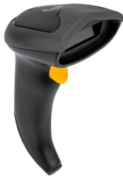
Image COMS Scanning

Work with Windows , Mac OS, Android and Linux