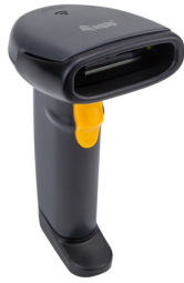
Image COMS Scanning

Work with Windows , Mac OS, Android and Linux