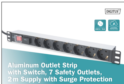
Aluminum Outlet Strip with Switch, 7 Safety Outlets, 2m Supply with Surge Protection