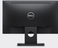
Back view - Cable management slot

Easily adjust the panel to your preferred viewing position.