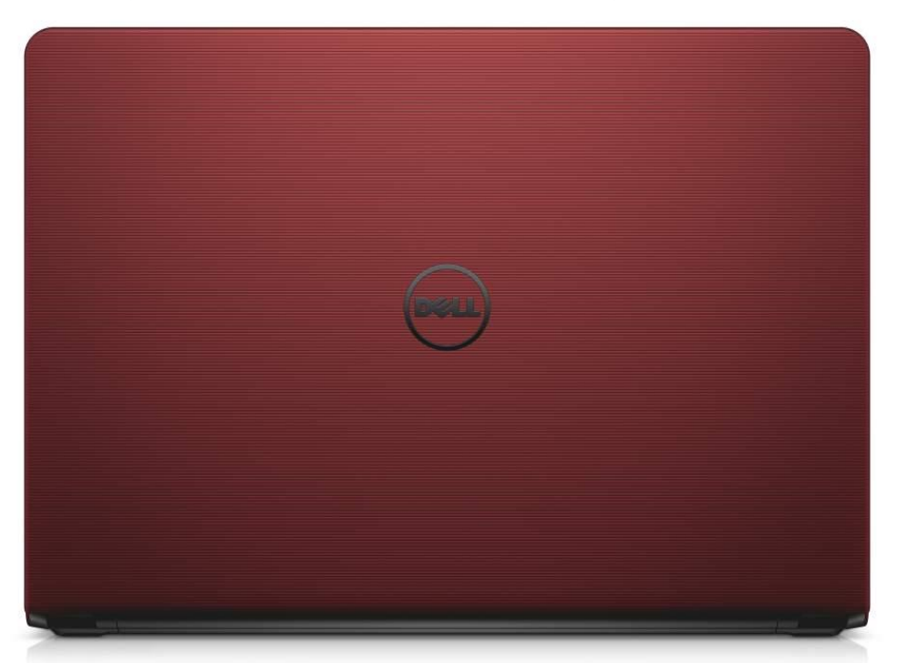
Micro Stripe pattern in Matte Metallic Red