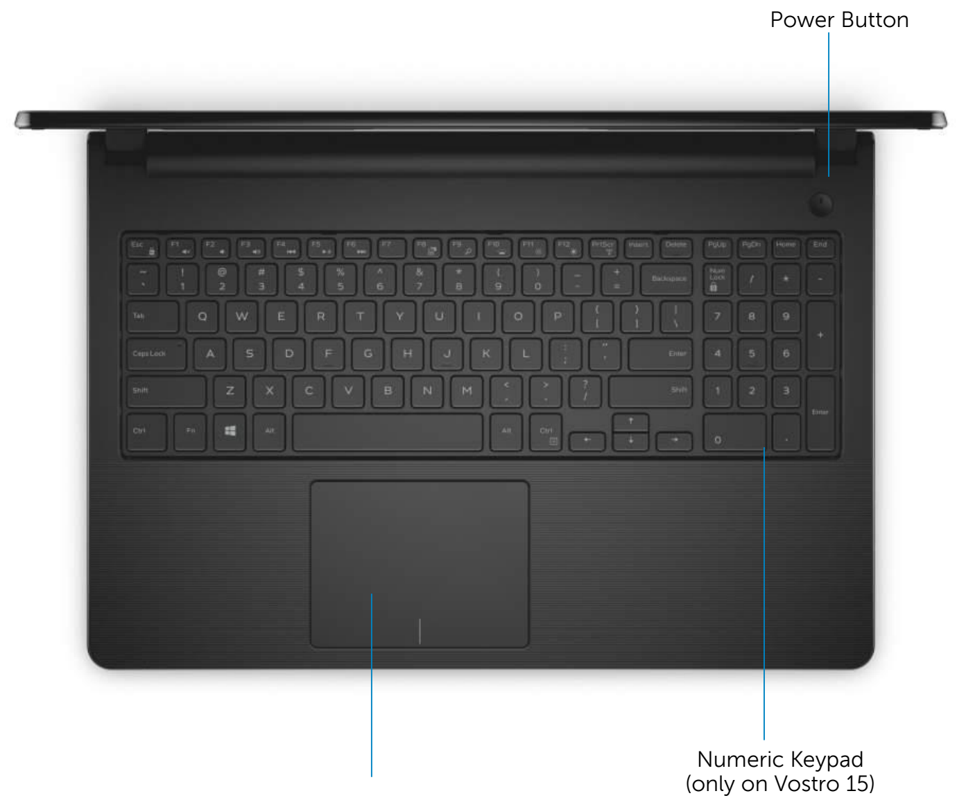
Multi-touch gesture-enabled pad