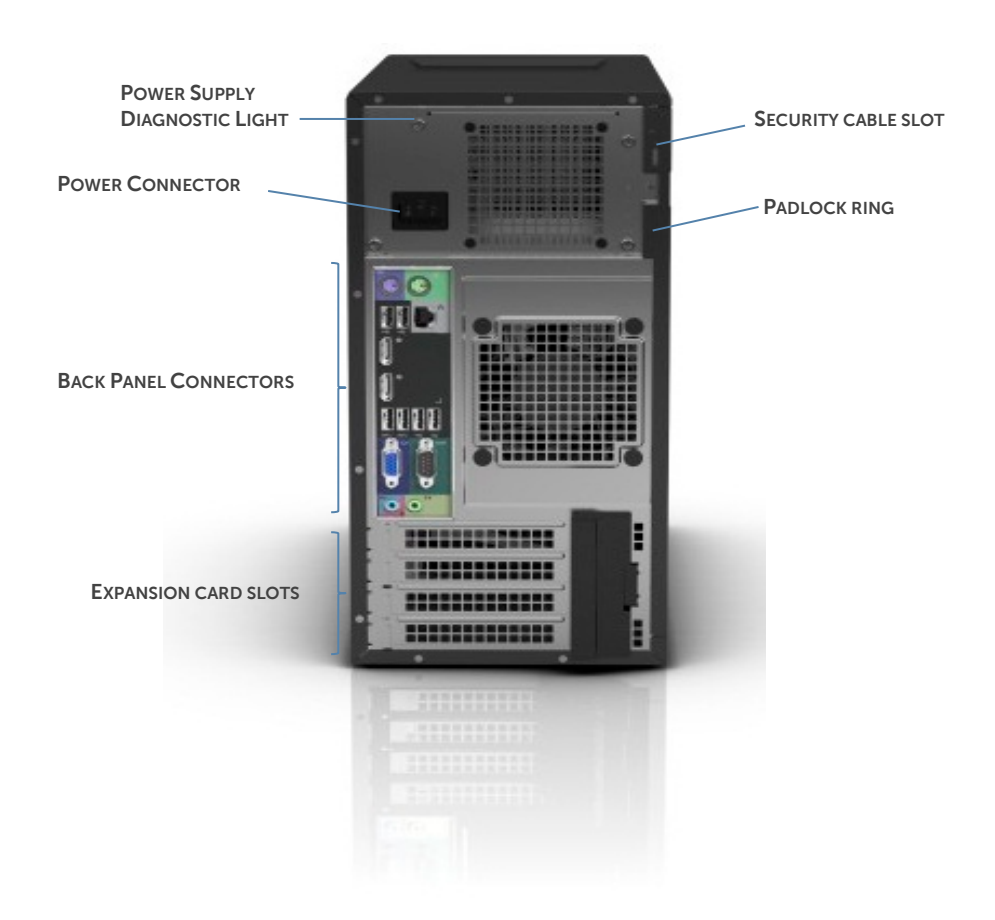
Figure 2. Back panel view and features

Figure 2 shows the features on the back of the T20 chassis with components and features described in this guide.