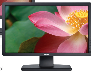
Dell Professional P2012H 20" Monitor