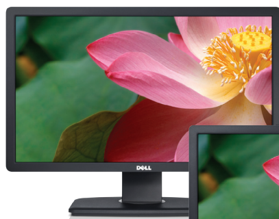
Dell Professional P2212H 21.5" Monitor

Dell Professional P2312H 23", P2212H 21.5" & P2012H 20" Monitors with LED backlights