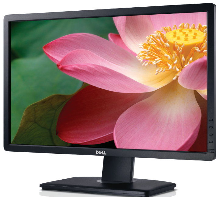
Dell Professional P2312H 23" Monitor

Get the perfect blend of productivity-boosting performance and comfort plus eco-friendly design with the Dell Professional P2312H 23", P2212H 21.5", and P2012H 20" monitors with LED