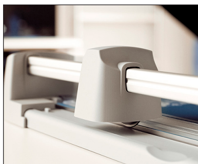
Features a ground self-sharpening rotary blade that cuts in either direction.