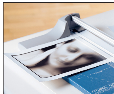
Automatic clamp holds work securely and prevents shifting while trimming.