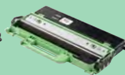
Waste Toner Box WT229CL