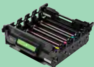
Drum Unit DR625CL