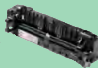
Fuser Unit FD-5000